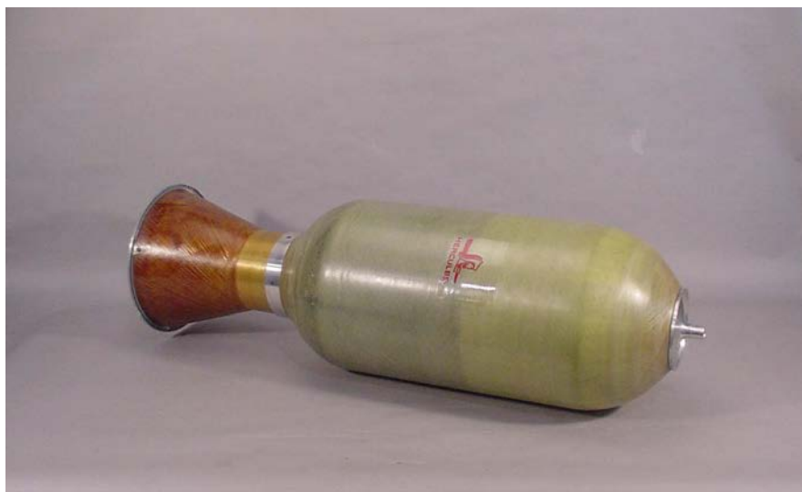
Figure 2: A Casing From an Altair Rocket Stage, Essentially a Composite Overwrapped Pressure Vessel (Source: Smithsonian National Air and Space Museum).

A U.S. Army report describes trying to shift to titanium (Ti) alloys [6–8] to leverage the lightweight nature of the material but specifically states that a suitable momentum trap needs to be devised before this would be possible (as well as mitigating internal damage due to erosion). This report also mentions developing a metal matrix composite as a jacketing material but mentioned how no data were available on fatigue, thermal fatigue, and high-temperature fatigue (no reference to this program was provided). In addition, other work